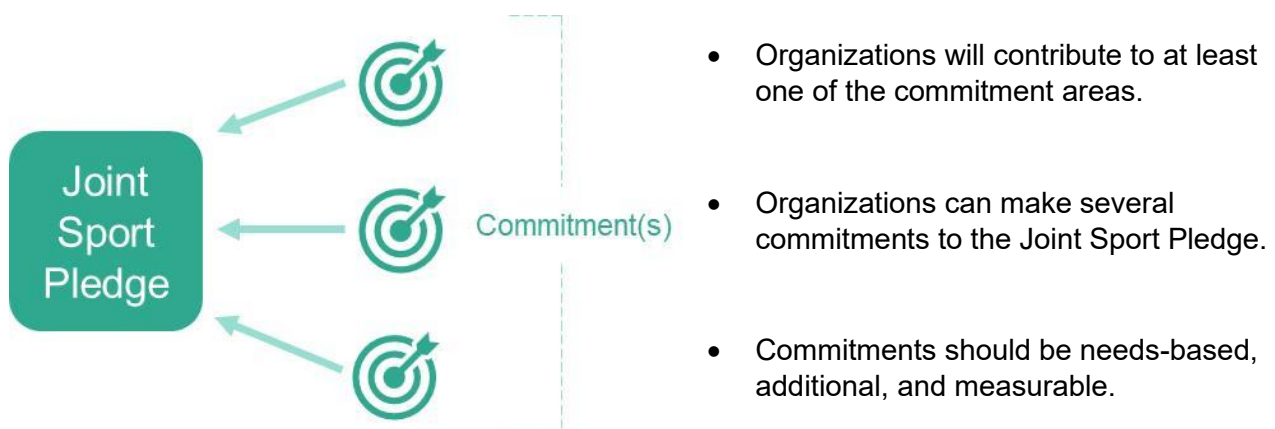
Figure 3: Pledge vs. commitment overview

Everyone can make a commitment. A commitment is unique to each organization or committing entity. A commitment details the actions you will take and the changes they will make, as a contribution to the overall Joint Pledge on Sport 2023.