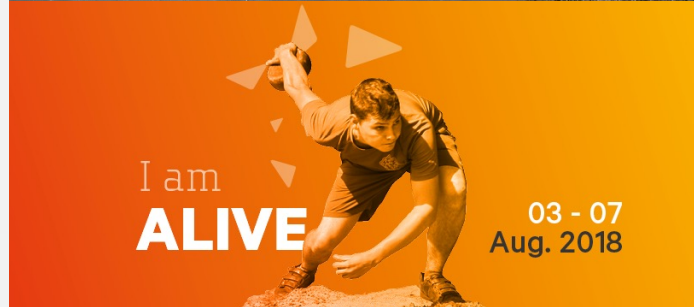
2018 Fryslân Region, Netherlands (Sport Fryslân)