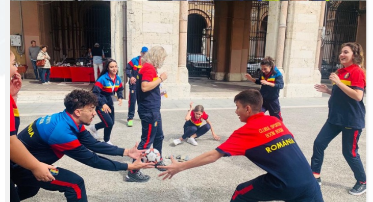
2022 Perugia, Italy (FIGEST)