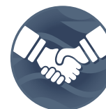
GOVERNANCE, LEADERSHIP & INTEGRITY