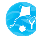
CULTURAL HERITAGE & DIVERSITY