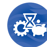
ECONOMIC IMPACT & RESOURCES