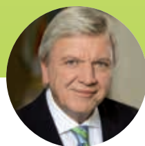
Volker Bouffier Minister President State of Hessen