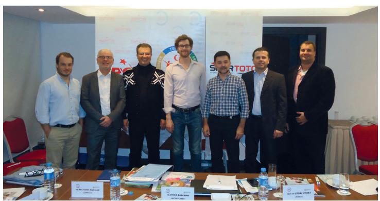
The new TAFISA Europe Steering Committee met for the first time in Istanbul, Turkey, January 29th - 31st, 2016

TAFISA Europe is proud to announce the organisation of its 1st TAFISA Europe Conference in Ljubljana, Slovenia, September 15th – 17th, 2016. For the first time, TAFISA Europe invites you to attend a Conference that will exclusively focus on European issues of Sport for All and thus follows the many requests received from European members. TAFISA Europe would like to thank the National Olympic Committee of Slovenia and the Sport Union of Slovenia to take the initiative to host the event.