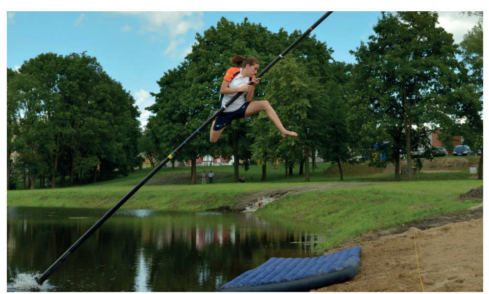
Fierljeppen, a traditional sport from Friesland in the Netherlands

children. TSG preserve chances to take part in, and benefit from the virtues of community interaction and culture. They are a living legacy of what has gone before us, and how we can enrich the future.