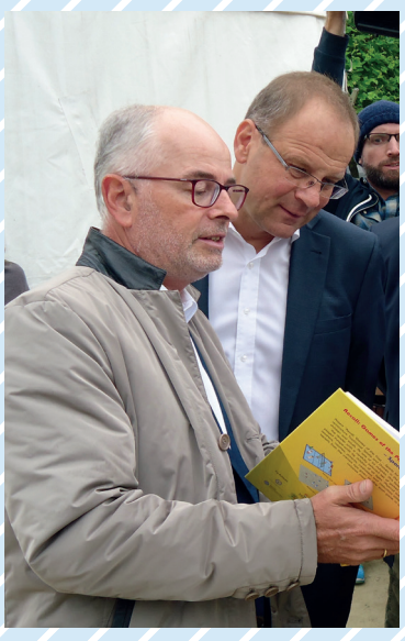
TAFISA Secretary General and European Commissioner For Education, Culture, Youth and Sport Tibor Navracsics

As the European Commission Directorate General for Education and Culture (DG EAC) decided, a high level group on grassroots sports has been formed in order to "evaluate the place and role of grassroots sport in European society and provide ideas on how the EU could better support grassroots sport. It will also analyse the role of grassroots sport in the promotion of tolerance and social inclusion".