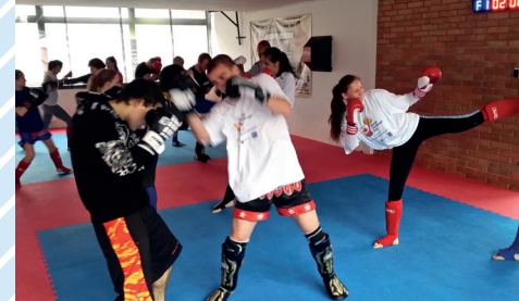
WCD in Serbia