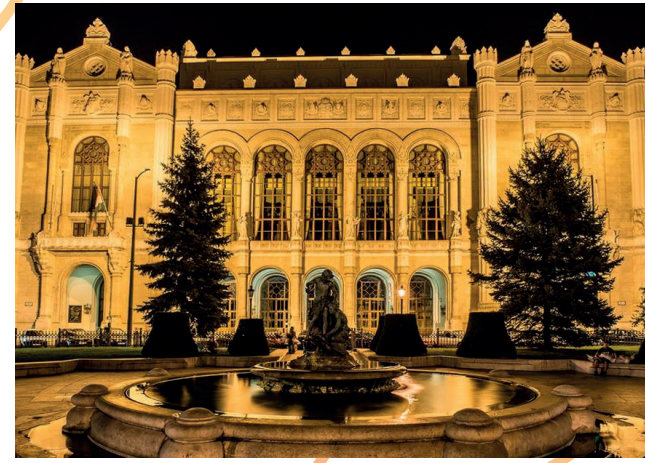
The Vigadó Concert Hall, a prestigious venue for an outstanding Congress

Discover our new TAFISA Board Member and the cities selected to host our next TAFISA worldwide events (TAFISA World Congress 2019 and TAFISA Sport for All Games 2020)!