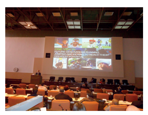
TAFISA Secretary General presenting at the AFIDE 2015

TAFISA is proud to announce the organization of its 1st Pan-American Congress of Sport for All in 2016. Big thanks are extended to the long-standing TAFISA member INDER, the Cuban National Institute of Sport, Physical Recreation and Recreation, which has offered to host the Congress as part of its Cubamotricidad Convention to take place in Varadero, Cuba, May 25th - 28th, 2016.