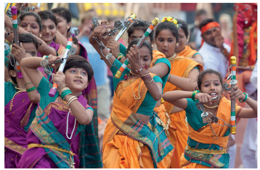
Traditional Sports and Games bring positive experiences in sports and physical activity to children.

Traditional Sports and Games (TSG) are more than their title suggests. In the purest sense, they are the games and movements that are traditional to our cultures, from dances to ball games and water sports. But they are more than that. TSG form a significant