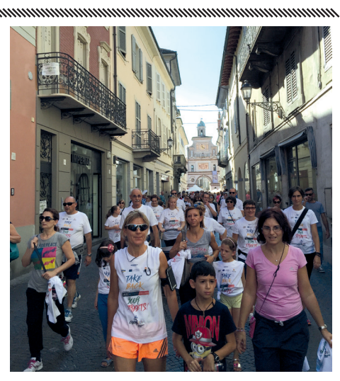
Take Back Your Streets in Crema (Italy), September 2015

Launched across 11 cities in as many countries in 2015, the first edition of the #BeActive Challenge was successful with over 20,000 participants and 200,000 people reached. The program, designed as part of the EWoS Toolbox project co-funded by the Erasmus+program of the European Commission, essentially revolved around providing opportunities for activity to people in the city setting and was spearheaded by the Rise & Shine flash mob dance in the participating municipalities. This event was also the occasion to gather feedback on the practical implementation of such a project and use this experience to launch the pilot phase of the Take Back Your Streets... Take Back Your Future! program in 2016.